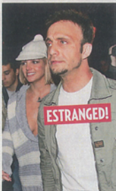
Spears thought Rudolph (in 2006) "did a horrible job" with her press, says a pal.

Check out Usmagazine.com's daily blog for the latest celebrity news