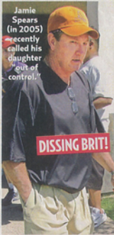
Jamie Spears (in 2005) recently called his daughter "out of control."

Retail Therapy — where Spears got a French pedicure April 18 — tells Us . "I was surprised at how mellow she is." One calming influence: her brother, Bryan, 30, with whom she still talks. (Her beloved little sis, Jamie-Lynn, 16, is attending high school back in Kentwood, Louisiana.) Yet Spears is serious about making some change. "She wants to be left alone."